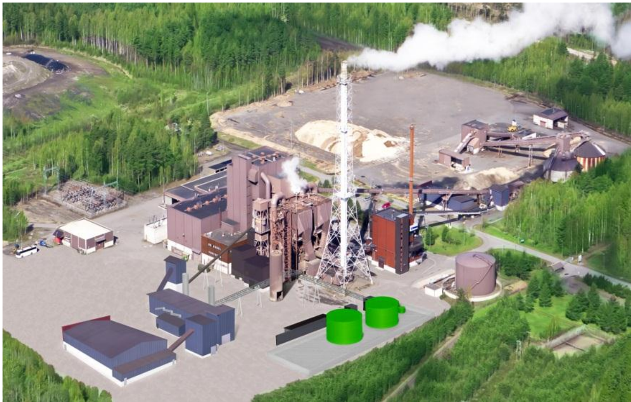
Picture 2. Trigeneration plant in Joensuu.

Bio-oil production will be integrated to existing CHP plant. Concept is a new type of trigeneration where third product is added to existing CHP plant. Heat production of CHP plant is primarily delivered to district heating network but whenever district heat demand is low, surplus capacity can be used for bio-oil production. Plant is designed to use forest residues and other local wood based biomass. Trigeneration increases utilization of CHP plant as well as usage of local biomass that otherwise would be unused. Joensuu bio-oil plant will produce 50,000 tons bio-oil every year that is equal to 200 000 MWh. Trigeneration plant in Joensuu is shown in Picture 2.