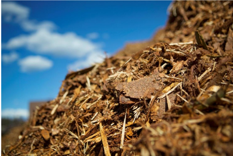
Picture 1. Typical biofuel of CHP plant in Joensuu.