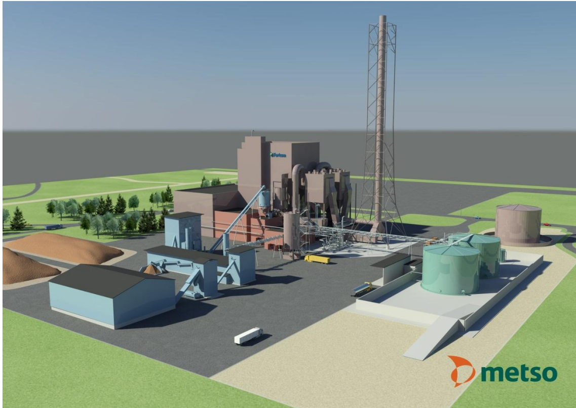
Picture 3. A turnkey contractor Metso's design about Joensuu trigeneration plant.

program. Joensuu plant is the first of its kind in the world on an industrial scale. The construction work started in June 2012. The pyrolysis plant will be in commercial operation during the autumn 2013.